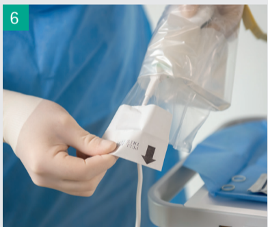
6 Pull the cover over the transducer and cable ("pull here" sticker)