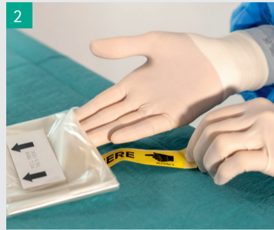
2 Locate middle fold of the sleeve by looking for the "Hand here" sticker