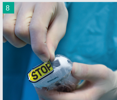
8 Perform time out and remove peel off sticker (STOP (Check) variants only)