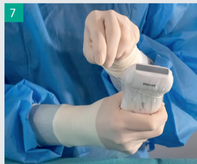
7 Fixation with rubber bands