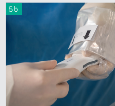
5 a Pick up the Ultrasound transducer (a*) or have it be handed to you (b) *Note: "probe here" visible for STOP (Check) variants only