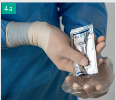
4 a Apply a small amount of sterile gel on either sleeve (a) or on the probe (b)