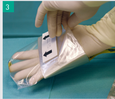
3 Insert hand into the cover