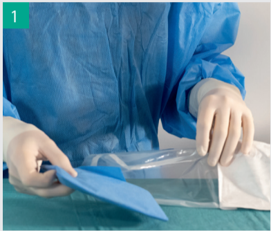
1 Open pouch and unwrap set